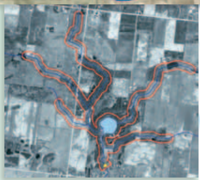
In this example, the yellow dot represents the location of the water intake. The red lines show the area of the Intake Protection Zone.