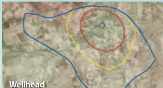
Wellhead Protection Area

To find out if your home is located within a Wellhead Protection Area or Intake Protection Zone, contact your local Source Protection Region or Area. You can find out which Source Protection Region or Area you live in at